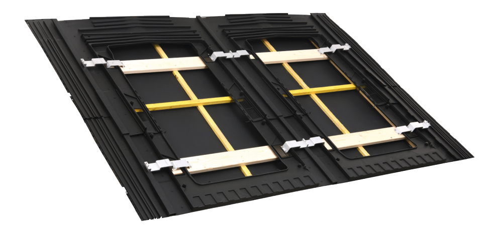
Extended compatibilities with new solar panels sizes

THE MOST RELIABLE BIPV SYSTEM ON THE MARKET