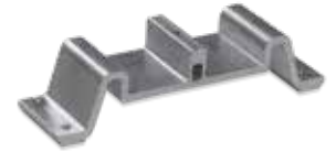
Adjustable cross member